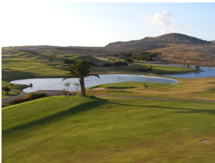
Fig 2 – Golf course watered with treated wastewater (island of Porto Santo, Madeira)

The increasing number of WRS for several applications – irrigation, industrial uses, groundwater recharge, non-potable urban uses, environmental and recreation uses – requires that the reliable supply of reclaimed water is ensured both in terms of quantity and quality.